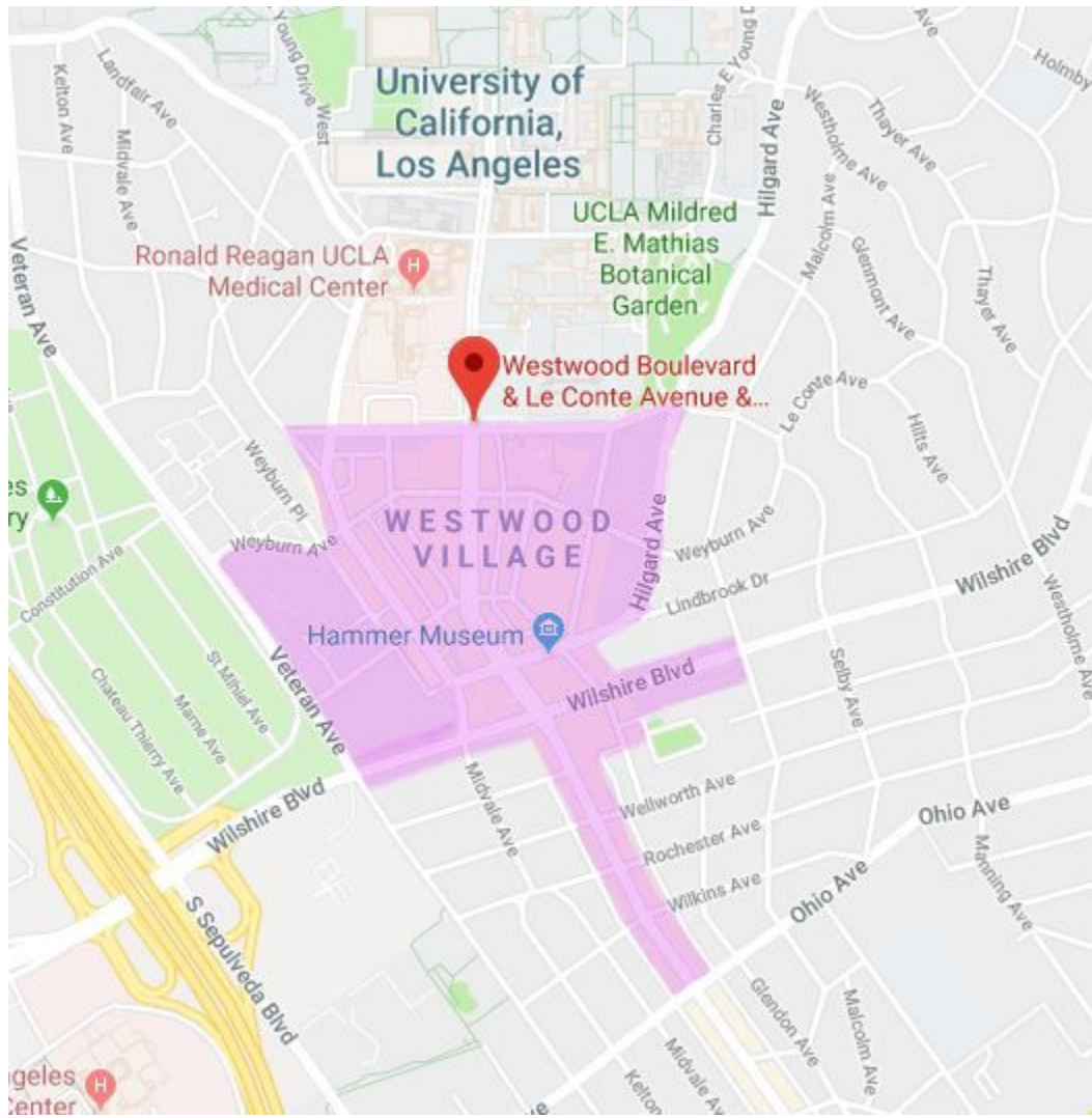
Pink – Shared Resources Boundaries